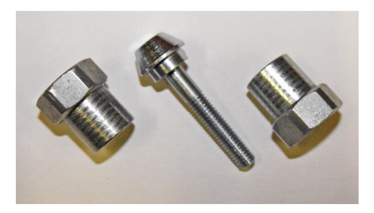
With Access To ISO 9001 Manufacturers We Can Source And Supply Non Standard Parts To Your Drawings Or Samples In A Range Of Materials And Finishes